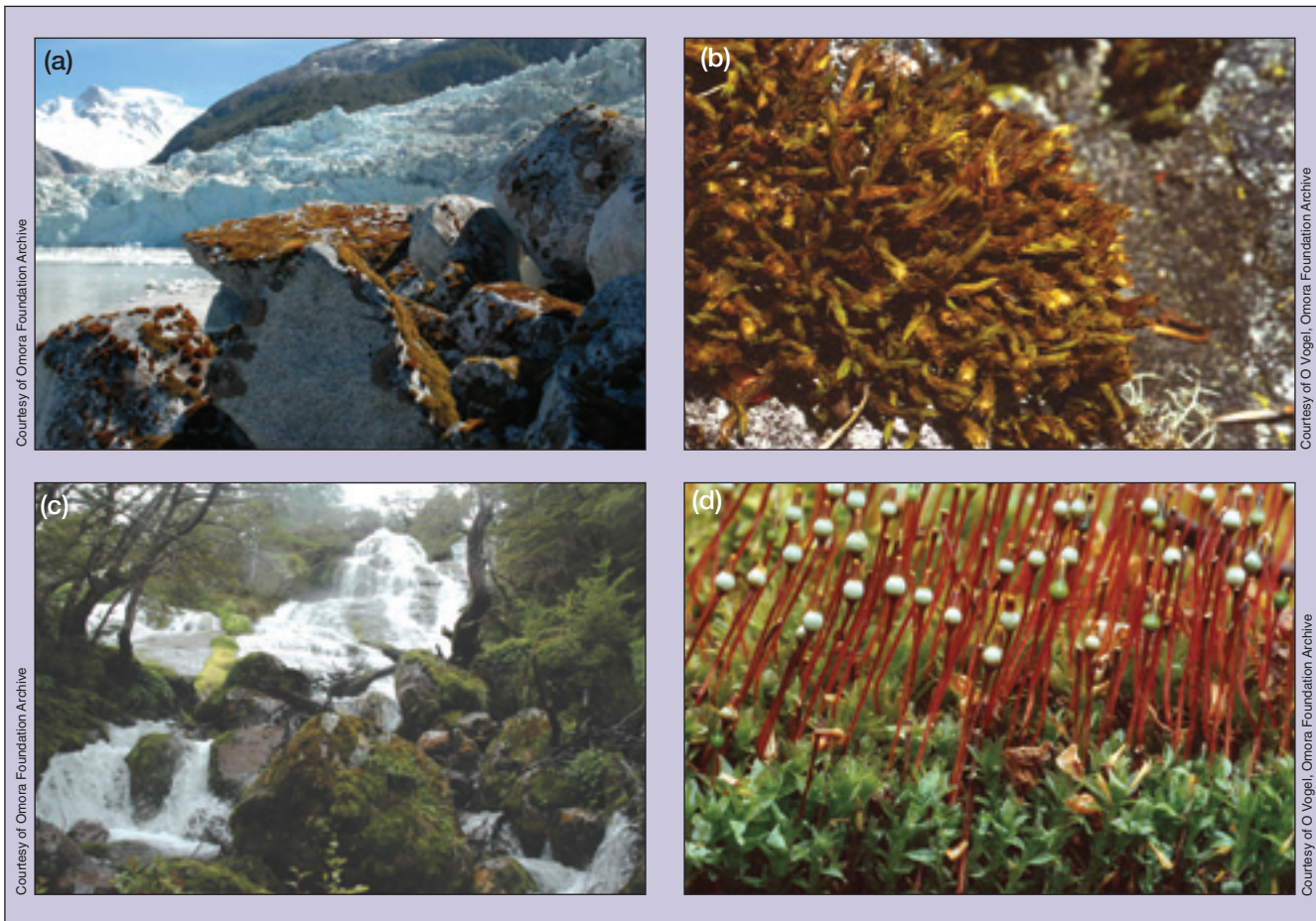
Figure 2. (a) Mosses and lichens are important pioneer species colonizing bare rocks on glacial moraines, as seen along the Beagle Channel in the Cape Horn Biosphere Reserve (CHBR). Through the weathering of rocks over long time periods, these mosses shape the substrate's physical and chemical properties. (b) One of the pioneer species confined to rock is a moss of the genus Orthotrichum , which resembles the globally distributed species Orthotrichum rupestre . However, ongoing research shows that some Orthotrichum populations in CHBR may warrant species recognition, as is the case with other austral moss populations in other species (Goffinet in prep ). (c) In the rainforests of the sub-Antarctic Magellanic ecoregion, high annual rainfall (> 4000 mm) favors the development of conspicuous assemblages of liverworts, mosses, and lichens on trees and rocks, which contribute to the flow of nutrients and the overall water balance. (d) Tayloria mirabilis (Splachnaceae), an endemic moss of the temperate rainforests of southern South America, stands out due to the bright whitish color of its sporophytes, the spores of which are thought to be dispersed by flies (Caicheo et al. in prep ). In the northern hemisphere, dispersal by insects is known only for a few moss species belonging to the family Splachnaceae.

cally restricted taxa, makes the sub-Antarctic Magellanic ecoregion a hotspot of global relevance for non-vascular flora. We refer to a bryophyte hotspot in a broad sense, meaning a species-rich area for bryophytes. This meaning is looser than the term “biodiversity hotspot”, as defined by Myers et al. (2000), which includes measurements of losses of natural habitat and numbers of endemic vascular plants.