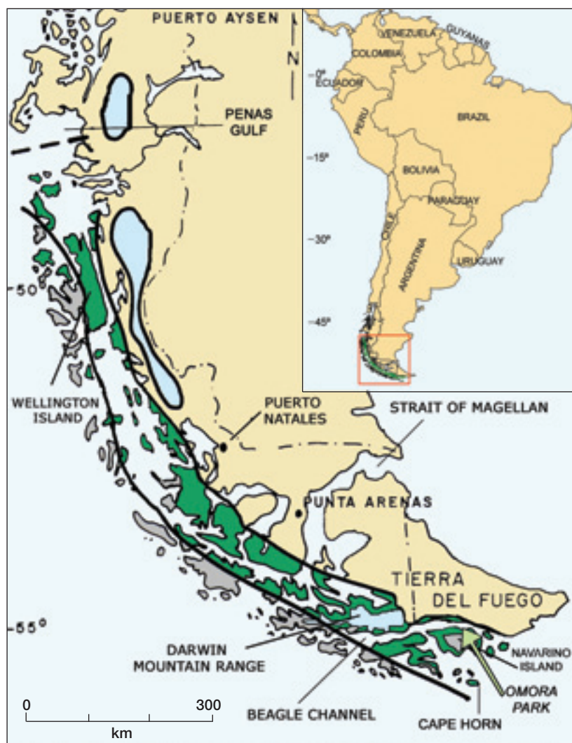
Figure 1. The sub-Antarctic (or sub-polar) Magellanic ecoregion, showing the full extent of evergreen rainforests (green) and Magellanic moorland (gray) from Cape Horn to Penas Gulf in Chile. Located on Navarino Island, south of Tierra del Fuego, Omora Ethnobotanical Park launched a bryoflora conservation program with international collaboration in 2000. As the research, education, and conservation center for the Cape Horn Biosphere Reserve (WebFigure 1), Omora Park serves as a long-term ecological research site of a nascent Chilean Long Term Ecological Research network, supported by the Chilean Institute of Ecology and Biodiversity (IEB; www.ieb-chile.cl ; see Rozzi et al. [2006a]).

investigated patterns of species richness in relation to conservation priorities in sub-Antarctic forests, tundra, and adjacent Antarctic ecosystems (Arroyo et al. 2005; Lawler et al. 2006).